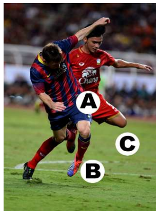
19. Spot the ball? 20. The player on the left?