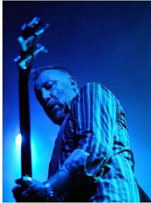
8. Who? 9. His most successful band?