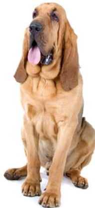
13. What breed?