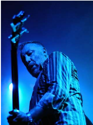
8. Who? 9. His most successful band?