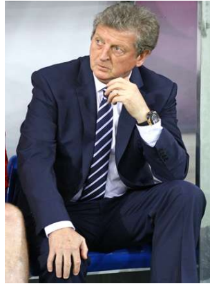
4. Who? 5. Currently manager of which team?