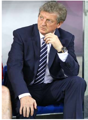
4. Who? 5. Currently manager of which team?