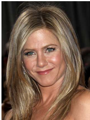
11. Who? 12. Her ex-husband?