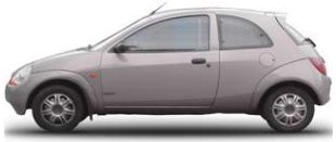
6. Make? 7. Model?