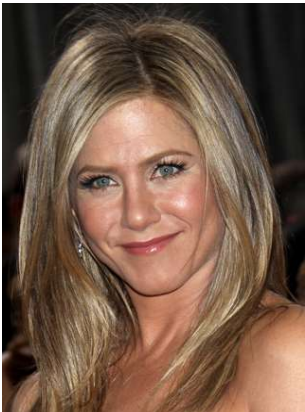
11. Who? 12. Her ex-husband?