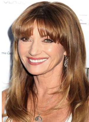
14. Who? 15. Played which Bond character?