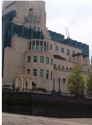
10. Which London building?