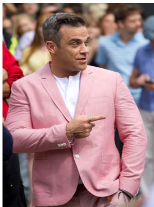
16. Who? 17. His home city?